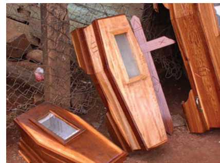
Figure 2 A burgeoning local industry in Uganda: the making of coffins, big and small, for the victims of HIV.