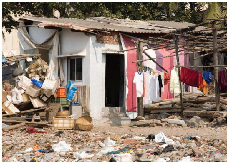
Figure 3 Signs of poverty in Uganda.

number of doctors, nurses, midwives, and health care workers that are needed; the deficit in Africa.” And he made the point that we must address that urgent need. But if you’re going to really make a difference in the capacity of Africa to deliver its own health care and to break free of this dilemma, you need to work at the top of the pyramid. You need to be building and strengthening centers of excellence, creating better and stronger medical schools, nursing schools, hospitals, and clinics.