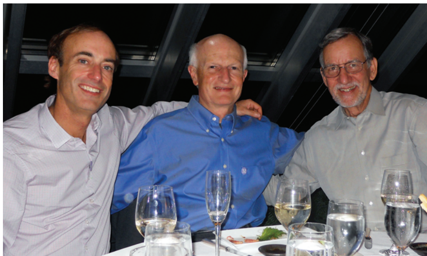
Figure 1 Ronald Vale (left), Michael Sheetz (center), and James Spudich (right) are the winners of the 2012 Albert Lasker Basic Medical Research Award.