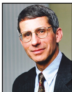
Anthony Fauci: Balancing NIAID's budgets.

Diego, told the JCI he had to close his center for a period last year due to "recycling" of funds. "The explanations were never sufficiently clear to distinguish between administrative callousness and thriftiness. I think it's fair to say that there is a lack of transparency to the administration of the