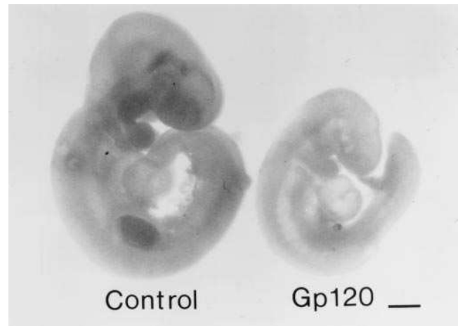
Figure 1. Photomicrograph of E9 mouse embryos after 6-h whole embryo culture in rat serum. Initial somite count for both embryos was 18. Left, control embryo; right, embryo treated with gp120 at 3 \times 10^{-8} M. Sagittal view, bar = 0.5 mm.