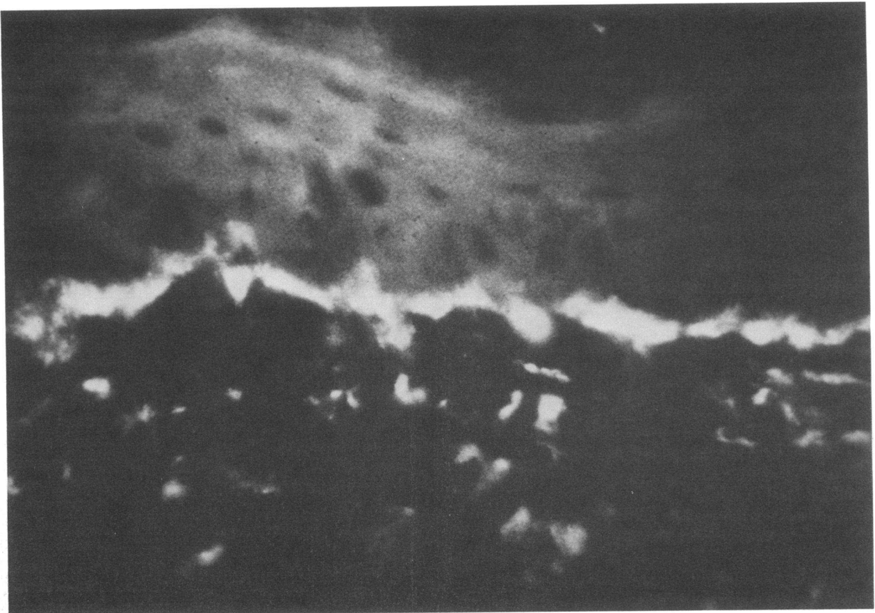
FIGURE 2 Immunofluorescence of the DEJ of normal skin from the deltoid region from a patient with active SLE stained for properdin. An intensely staining band of granular fluorescence is present at the DEJ. (Original magnification \times 216 ).

systemic sclerosis with sclerodactyly, Raynaud's phenomena, rheumatoid nodules, latex fixation of 1:320, ANA speckled pattern with a titer of 1:256, C3 of 116 mg/100 ml, and a negative LE cell test. Two of four patients with cutaneous vasculitis were positive (C3 and properdin in one, and C3, and C4 in one). The patient with juvenile rheumatoid arthritis whose erythema multiforme-like rash was biopsied had C3 in the DEJ. The patient with rheumatoid arthritis whose lichen planus lesion was biopsied had C3 deposited in a granular pattern as well as globular deposits in the DEJ.