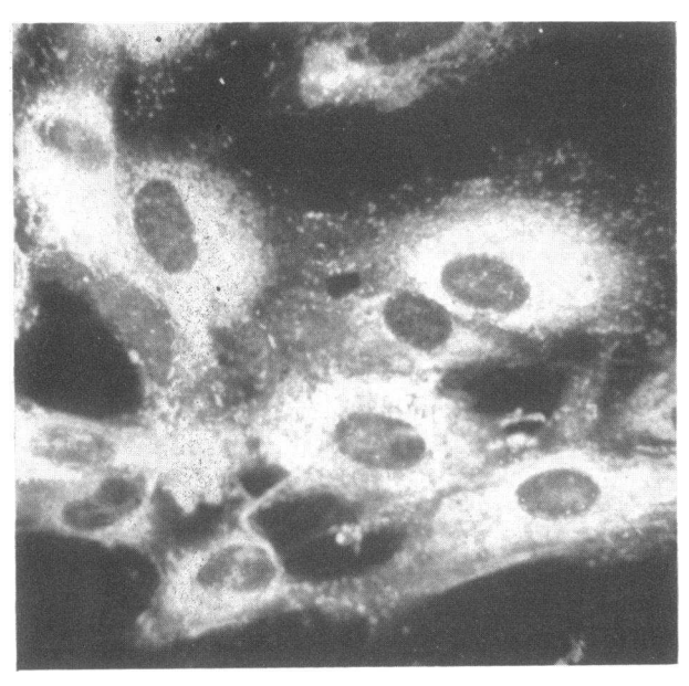
FIGURE 1 Immunofluorescence study of cultured human endothelial cells. Cells were treated with rabbit anti-AHF and then with fluorescein-conjugated goat antirabbit globulin. The cells are brightly stained ( \times 960).

Identification of AHF antigen in culture medium and cells. No AHF antigen was present in the culture me-