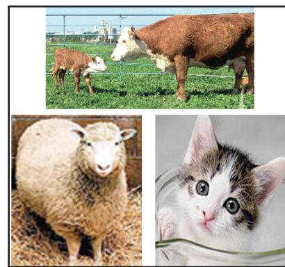
Cloned cows, sheep, and cats. Are humans next?

Thus, despite the UN's wranglings, it still seems that time is on their side