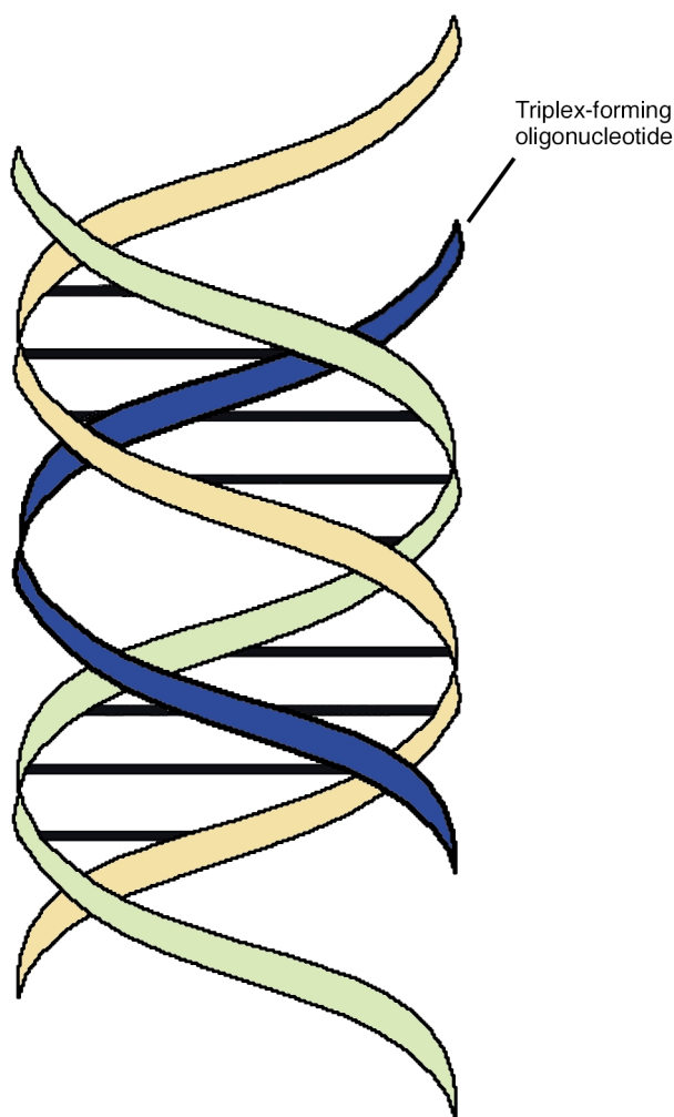
Figure 1 Diagrammatic depiction of a DNA triple helix, with the third strand binding in the major groove.

to bind in the antiparallel purine motif were used, but it should be noted that in those experiments the 30-bp polypurine site in the supFG1 gene afforded the possibility of high affinity third-strand binding by G-rich TFOs synthesized with standard DNA chemistry (16).