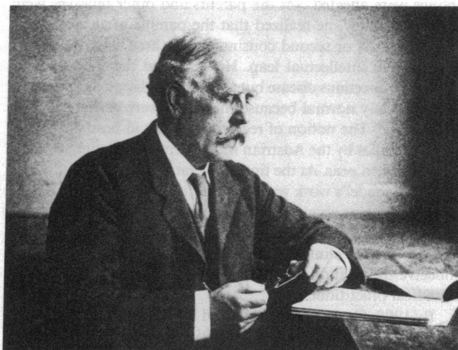
Figure 2. Archibald E. Garrod, 1857–1936.