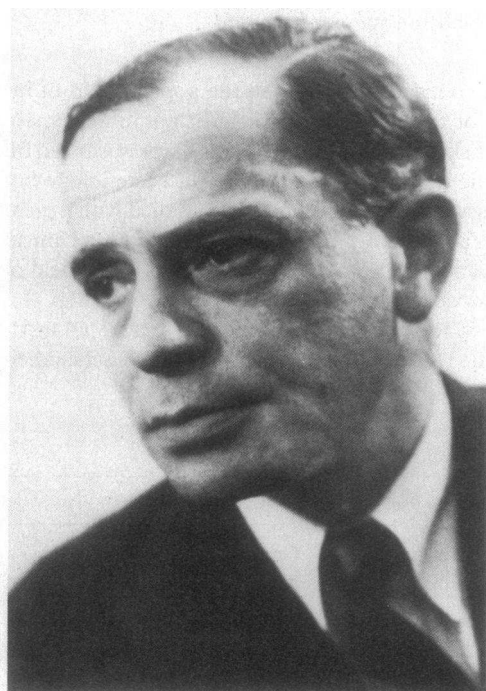
Figure 5. Rudolph Schoenheimer, 1898–1941.

mer, lived only 43 years—from 1898 to 1941 (Fig. 5). He is considered by many historians to be the single individual most responsible for ushering in the modern era of molecular biochemistry. Schoenheimer was a physician who began his career in the mid 1920's as a pathologist, studying atherosclerosis in the cholesterol-fed rabbit. He worked with a great mentor, Ludwig Aschoff, who was the world's expert on the pathology of atherosclerosis. Schoenheimer became fascinated with the four-ring structure of cholesterol. He wondered how such a complex