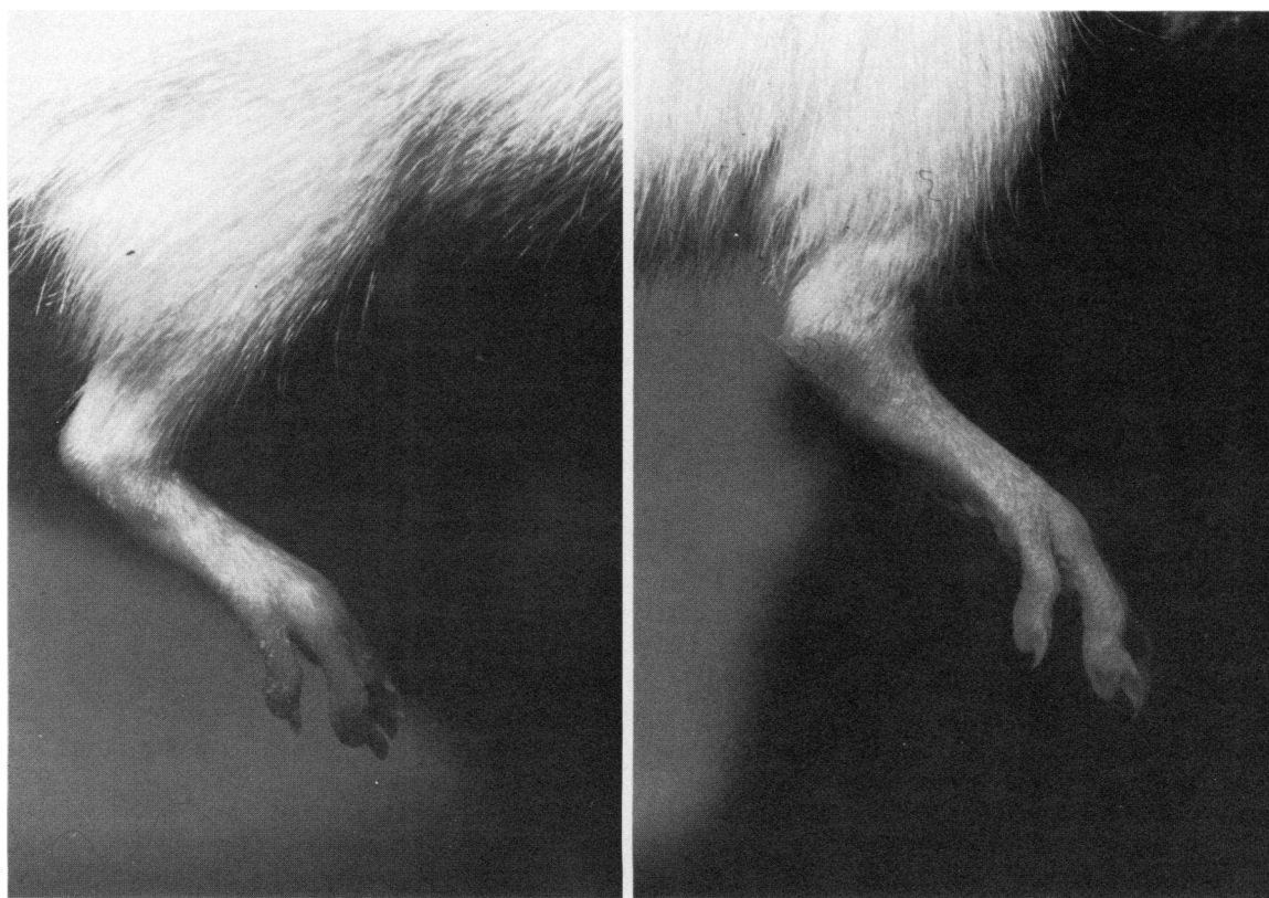
FIGURE 3 Arthritic ankle of recipient of cells sensitized to type II collagen on the right compared with a normal ankle on the left. This ankle was scored 2 by the arthritic index.