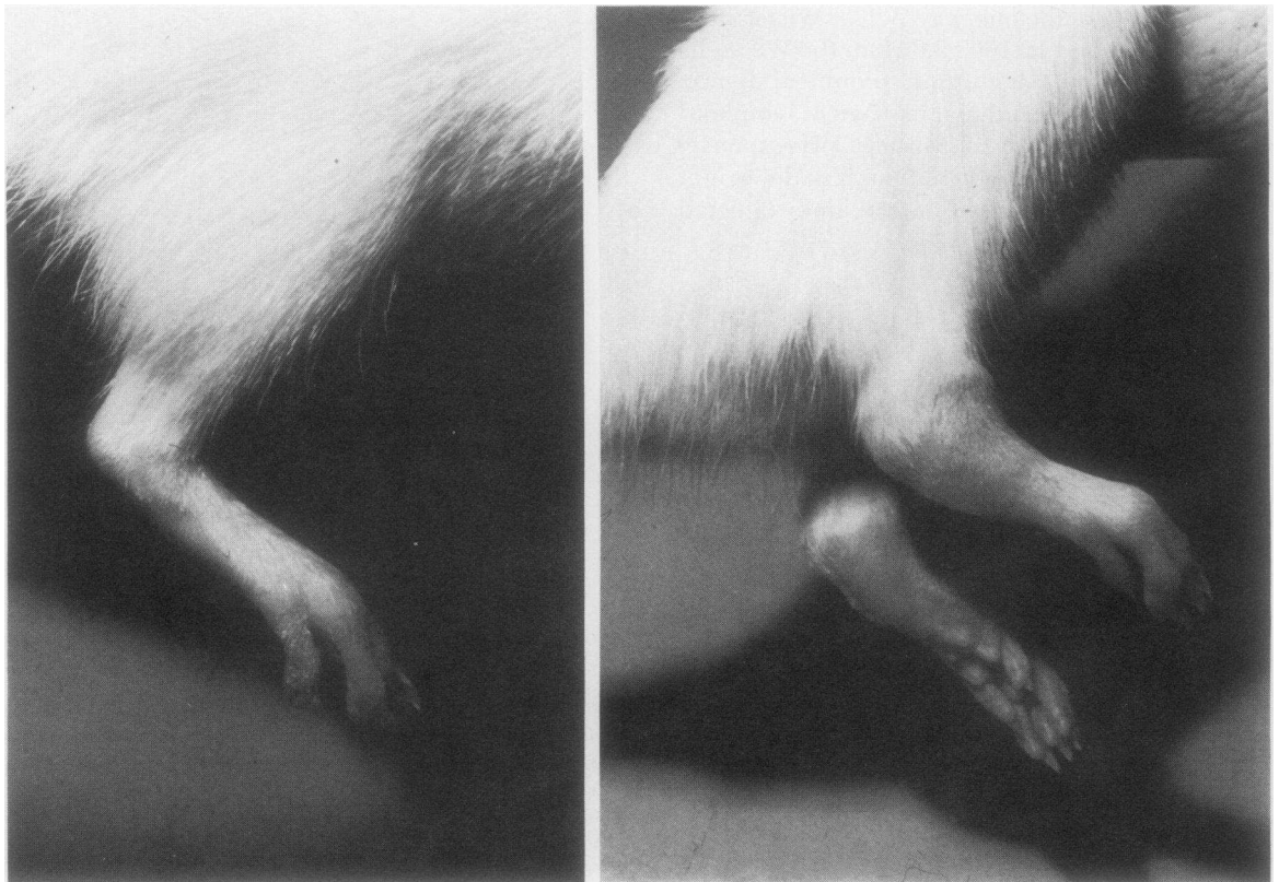
FIGURE 2 Ankle of arthritic donor rat on the right scored 4 by the arthritic index compared with a normal rat on the left.

Evaluation of arthritic recipients for humoral and cellular sensitivity to type II collagen. Evidence of humoral and cellular responses to type II collagen differed in arthritic donors and recipients. In contrast to