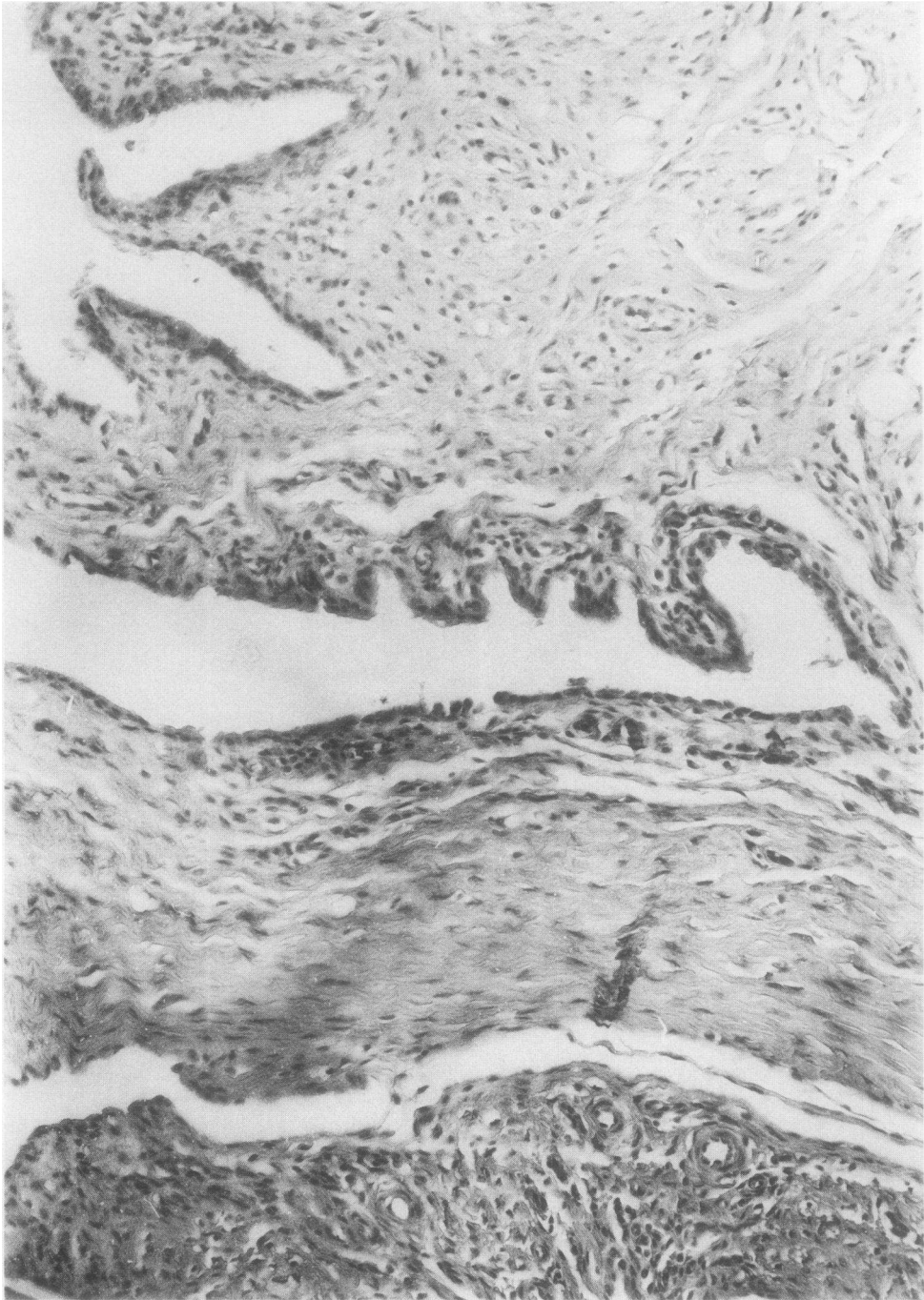
FIGURE 5 Histologic evidence of synovitis, consisting of synovial hyperplasia and mononuclear cell infiltration in arthritic ankle joint of rat that received cells sensitized to type II collagen 21 days earlier. Hematoxylin and eosin. \times 200 .

Histologic evidence of ankle synovitis at the time of sacrifice was also lacking in the 50 controls examined bilaterally without knowledge of what type of cells, antigen, or serum the rat had received. There was no sign either clinically or histologically in sections of the