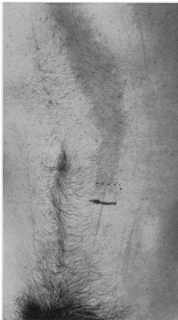
FIG. 3. THE FLARE SURROUNDING A LINE MADE WITH A SHARP NEEDLE ON THE SKIN OF THE SAME PATIENT AS FIGURES 1 AND 2

The patient in this category had a surgically verified syringomyelic cavity of the cervical cord, and was unable to perceive pain or temperature variation over dermatomes C-5 through T-2 bi-