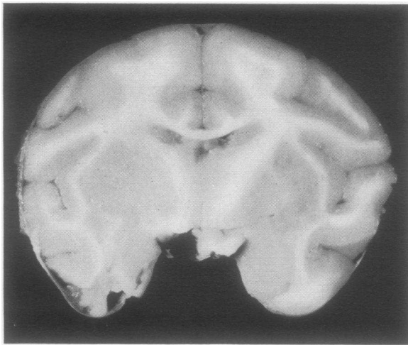
FIG. 1. CROSS SECTION OF MONKEY'S BRAIN SACRIFICED 6 MONTHS AFTER FILM WAS LEFT OVER THE CEREBRAL CORTEX TO CLOSE A DURAL DEFECT.

Notice that the film is still present. There are no adhesions between the cerebral cortex and the implanted film. The cerebral cortex appears entirely normal.